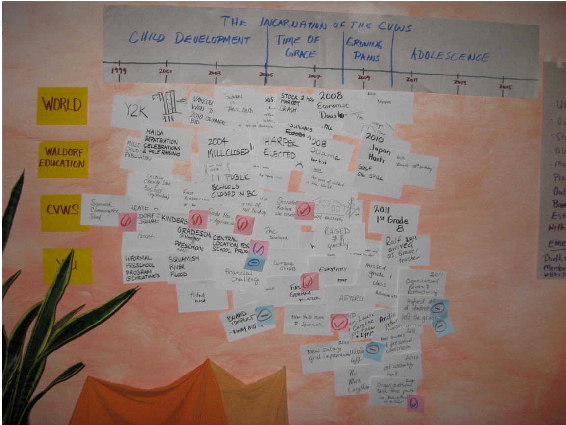
Group Reflection on Biography of the Cedar Valley Waldorf School:

A word cloud reflecting on the biography of the Cedar Valley Waldorf School. The words are arranged in a roughly circular pattern and include: Diversity, World, Community, Communication, Dedication, Faith, Love, Compassion, Persistence, Luck, Belief, Generosity, Trust, Endurance, soul, Warmth, Flexibility, and Spiritual.